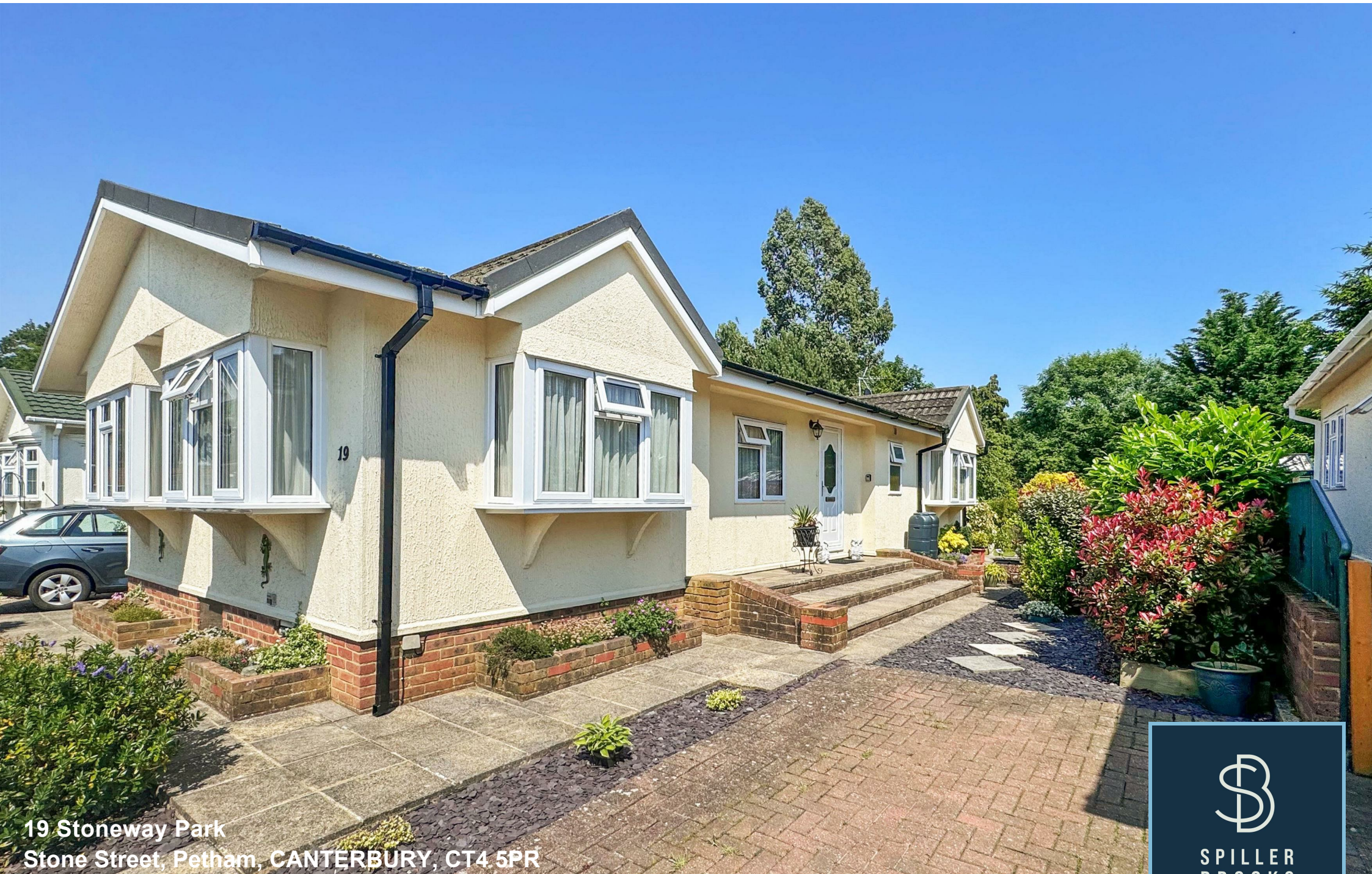
19 Stoneway Park Stone Street, Petham, CANTERBURY, CT4 5PR